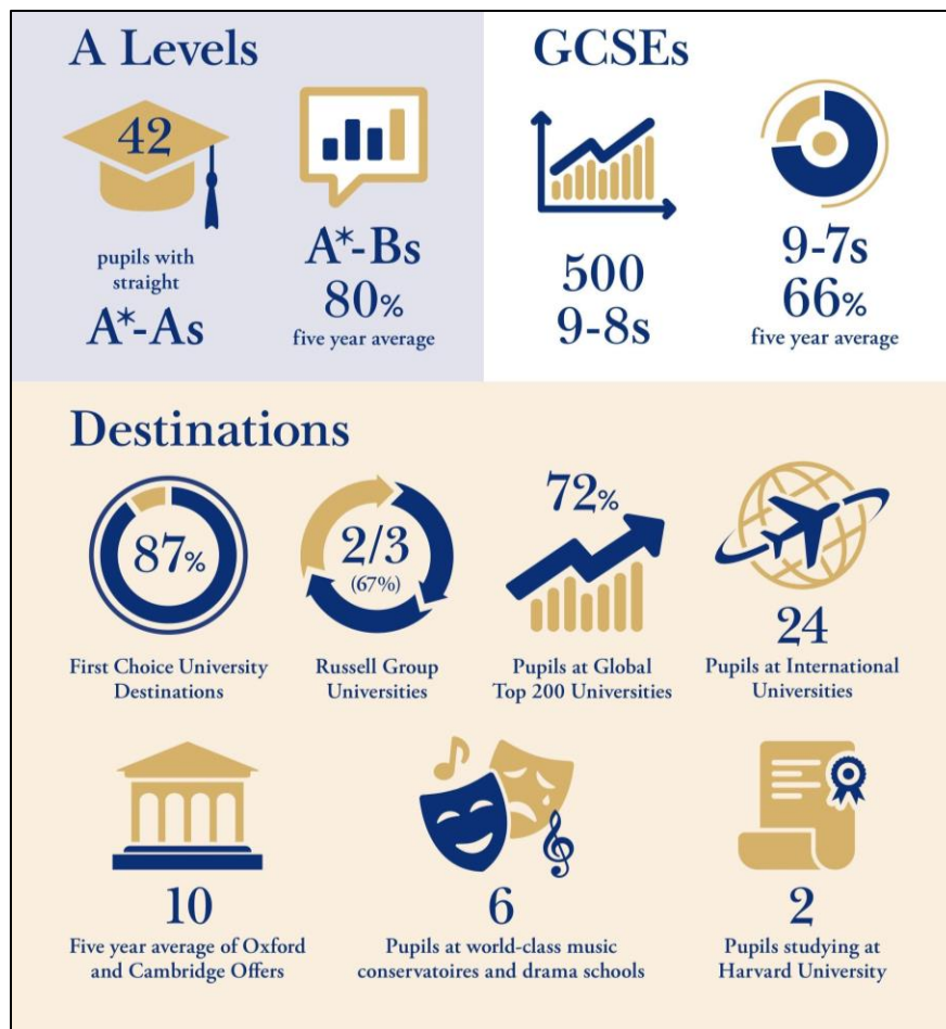
2024 Public Examination Results at Shrewsbury

In recent years, around 5% of our leavers have gone on to Oxford and Cambridge and virtually all have taken up places at the university of their first choice. We expect about 80% of A Levels each year to be passed at A*, A or B grade. But there is as much joy for pupils who surpass his or her expectations as there is for the pupil whose progress to top grades always seemed more certain. Our Summer 2024 results and destinations are summarised below.