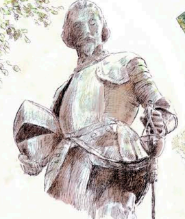
Sir Philip Sidney 1554-1586 Old Salopian, courtier, diplomat, soldier and poet.