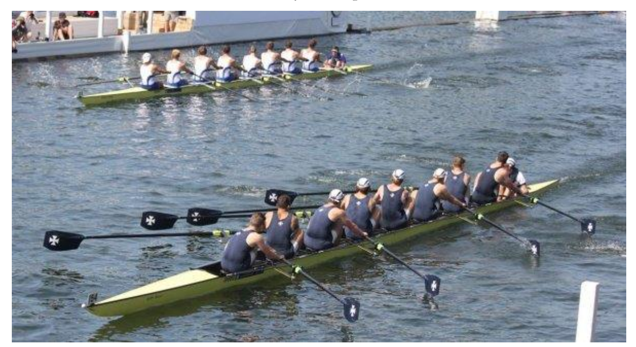
The 1st VIII against Bedford

On the Friday the 1st VIII met another selected crew in the form of Bedford School who had come 4th at the National Schools' Regatta. A tightly fought contest saw the 1st VIII take a small lead off the start which they maintained and used that cushion to respond to Bedford pushes down the course. The crew recorded a win by one length.